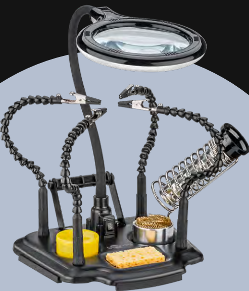
Soldering Aid with Magnifying Lamp and Gooseneck Arms