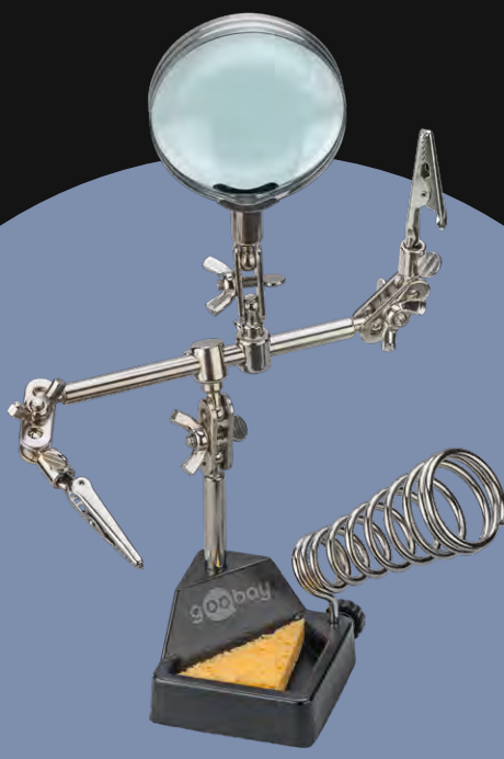
Third Hand with Magnifying Glass and Soldering Iron Stand