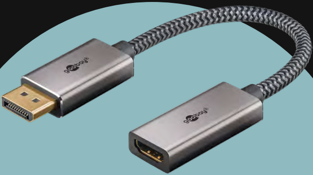
DisplayPort™/HDMI™ Adapter Cable