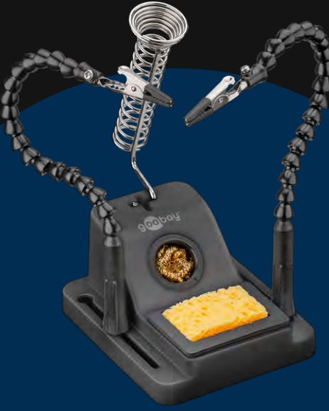
Soldering Aid with Gooseneck Arms and Soldering Iron Stand