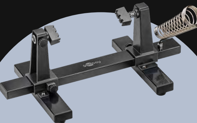
Board Holder with Soldering Iron Stand