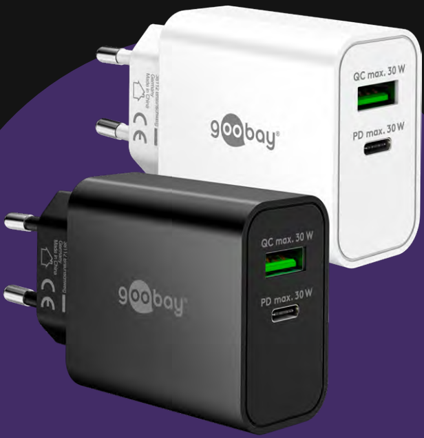
USB-C™ PD GaN Dual Fast Charger (30 W)