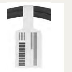
Packaging: Cable Tag

Supports advanced audio features such as eARC (Enhanced Audio Return Channel) and ARC (Audio Return Channel) for easy digital transmission from the TV to a soundbar or hi-fi system